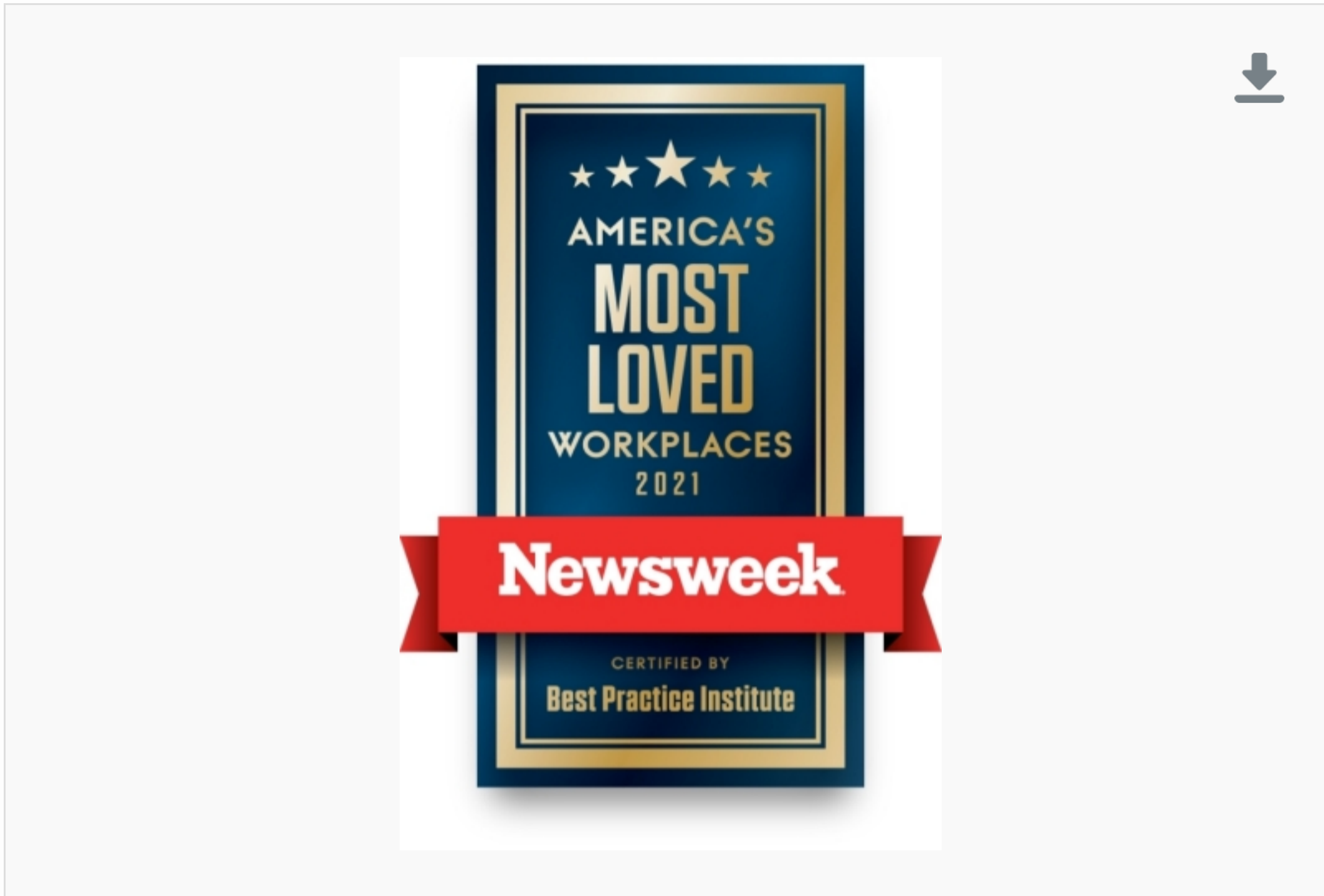
At Home, The Home Décor Superstore, has been recognized as a Top 100 Most Loved Workplace by Newsweek.